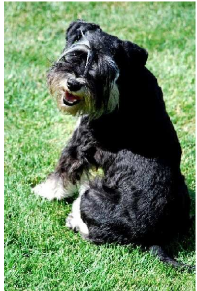
Nike Magic Merlin

however, 2 x 2 bipeds and four-legged (CH) were sometimes fast in the wood or on the meadow disappeared and had to be fetched back.