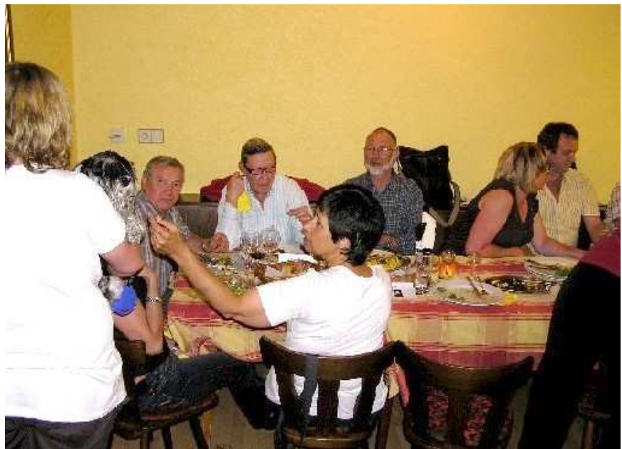
and enjoy the day in pleasant talks all around the Magic Merlin family.