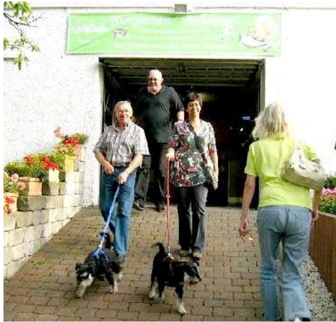
The 2 x 2 runaways return.

however, 2 x 2 bipeds and four-legged (CH) were sometimes fast in the wood or on the meadow disappeared and had to be fetched back.