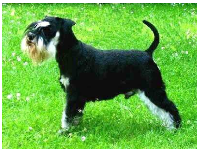
Ironman & Giorgio Armani Magic Merlin