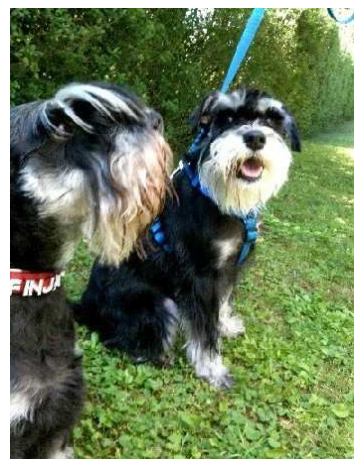
I love & Indian Summer