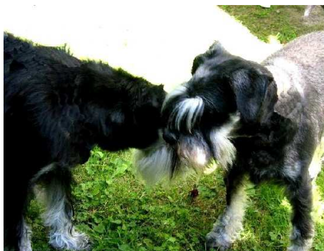
Melody & Indian Summer Magic Merlin