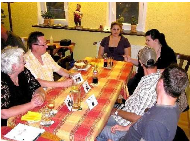
Everybody talks lively (to food comes??!???)