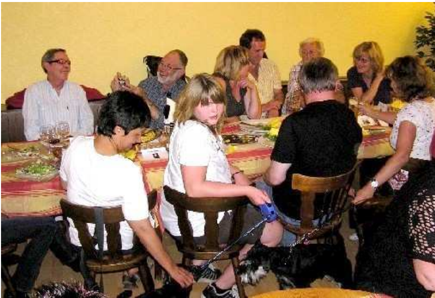
Not only our friends from Switzerland, but also all the others obviously feel fine

In the evening one moved in the restaurant under to celebrate further there.